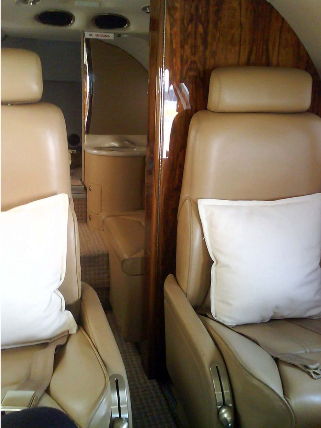
Executive Seating, Cabin Aft

VERIFICATION OF SPECIFICATIONS REMAIN SOLE RESPONSIBILITY OF PURCHASER AIRCRAFT SUBJECT TO PRIOR SALE AND REMOVAL FROM THE MARKET