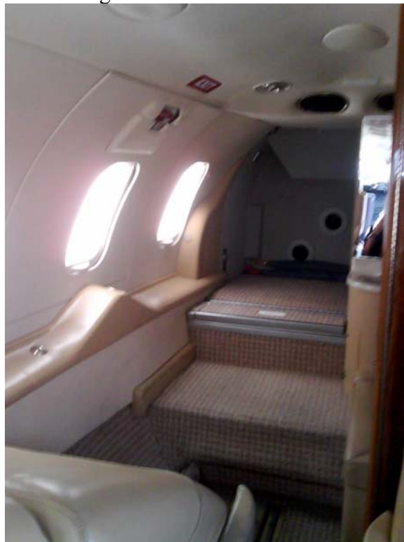
Cabin Aft Storage

MGTOW is 17'700 extended range tanks fuel lbs 4'600